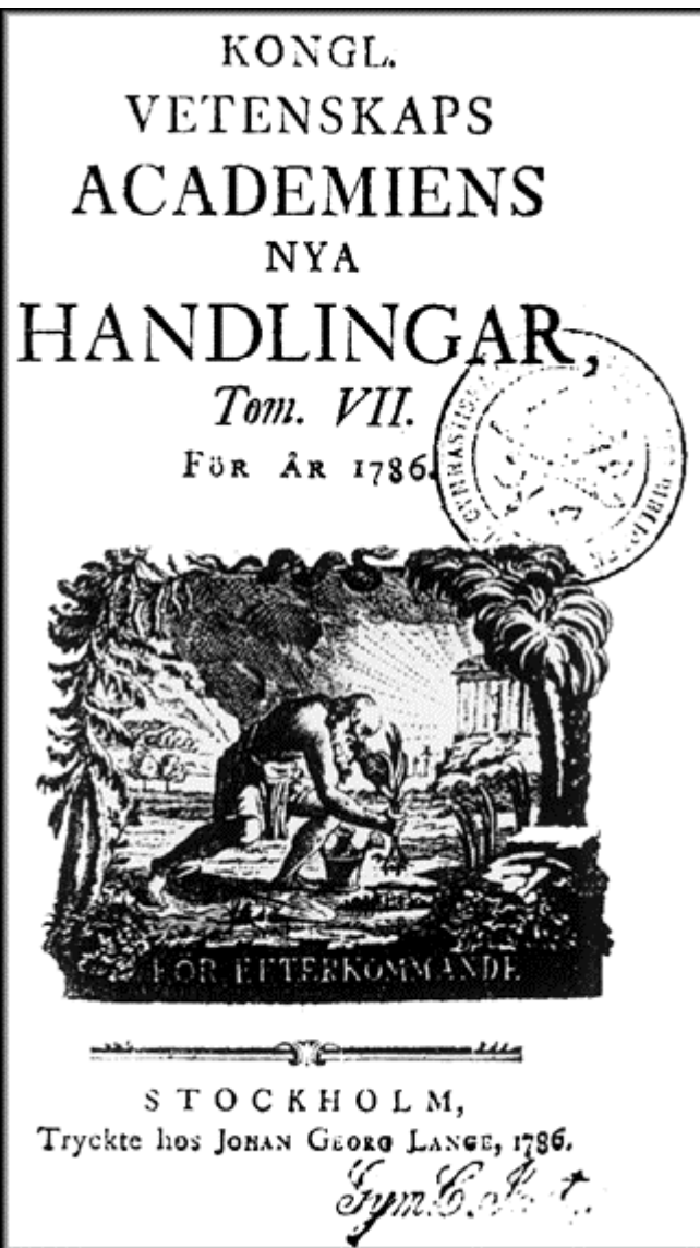
Fig. 3 Title page to the 1786 proceedings of the Swedish Royal Academy of Science, containing Hagströmer's description of a persistent foramen ovale in an adult.